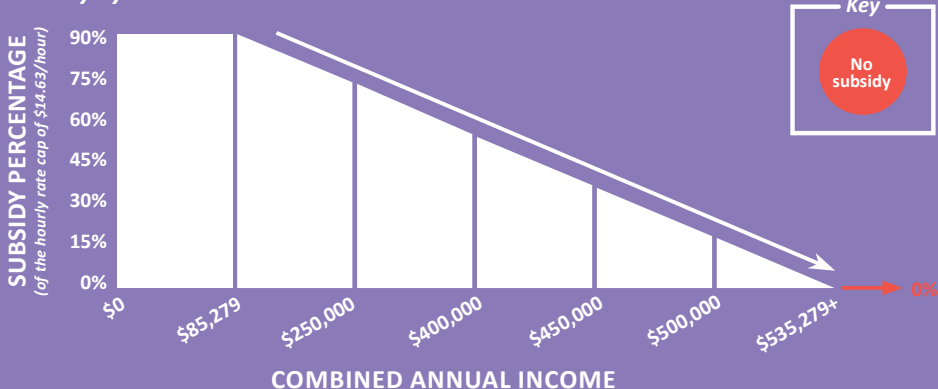
Subsidy by combined annual income

*Based on eldest or only child. Families with more than one child in care may be eligible for a higher subsidy for their second child and younger children.